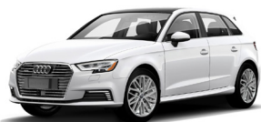
Audi A3 e-tron