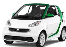
Smart Electric Drive