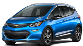
Chevrolet Bolt EV