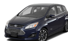
Ford C-MAX Energi