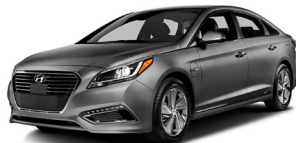
Hyundai Sonata Plug-In Hybrid