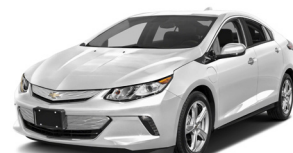
Chevrolet Volt (gen2)