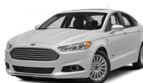
Ford Fusion Energy