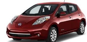
Nissan LEAF (gen1)