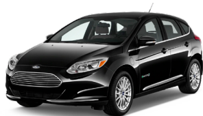
Ford Focus Electric