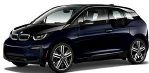
BMW i3/i3 REx