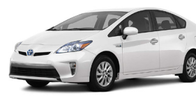
Toyota Prius Plug-In