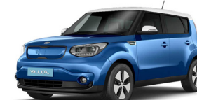
Kia Soul EV