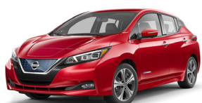
Nissan LEAF (gen2)