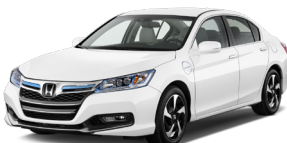
Honda Accord Plug-In Hybrid