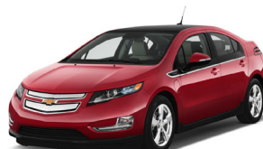
Chevrolet Volt (gen1)